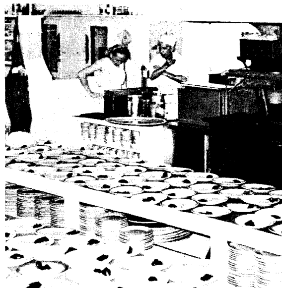
Dozens of plates are being filled with healthful foods. They were then carried on trays by the servers and placed on the dining tables.