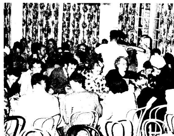
The dining room. Combined with the wonderful spiritual feast was this material feast—one of God's many bounteous blessings for which we were all thankful.